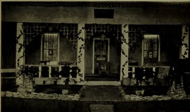
Amphictyonic Public Program Stage.

Literary societies are maintained by the students and are a large item in the college life. Irving was organized in 1884 and has now a standing of thirty-six years. Amphictyonic celebrates its thirtieth anniversary this year, having been organized in 1890. Membership in societies is, of course, voluntary, but the interest in their work is so general, that a student seldom fails to become a member of one of them. Each society holds twenty weekly meetings during the school year. At each meeting a program consisting of literary and musical numbers or of debates between individual members is given.